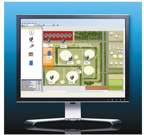
Figure 2. Network Visibility—Network Management Software Provides Critical Visibility to the Health of the Wireless Network Such as in This SNAP-ON Software Utility from Emerson Process Management

Also, systems should be available for global deployment, since the widespread adoption of Industrial IoT by end users is often