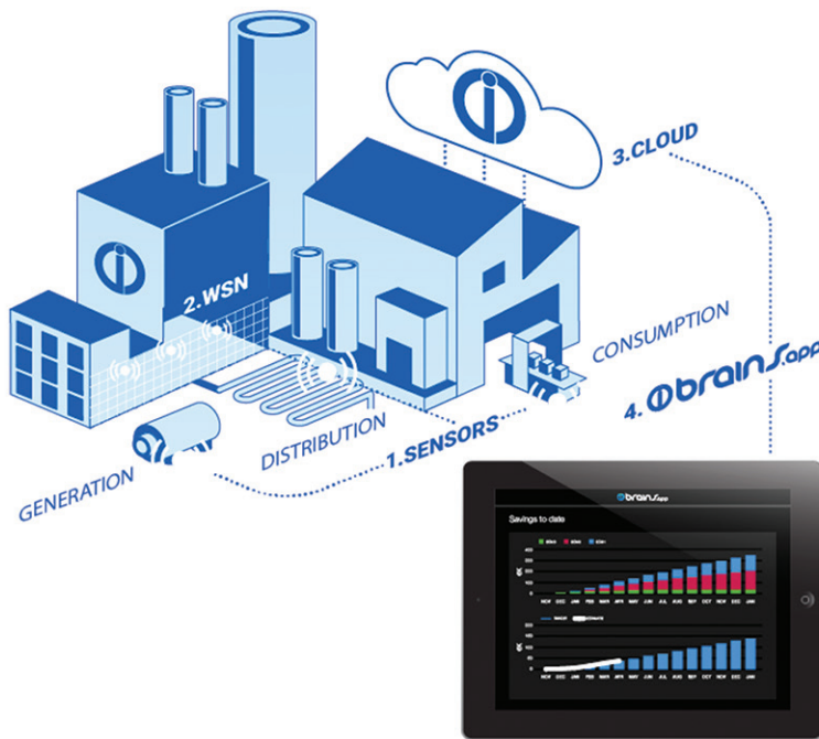
Figure 3. Driving Change—Software Analytics, Such as the Brains.App Software from IntelliSense.io, Use the Data from Industrial Wireless Sensor Networks to Streamline Plant Operations, Optimize Yield and Improve Safety

All registered trademarks and trademarks are the property of their respective owners.